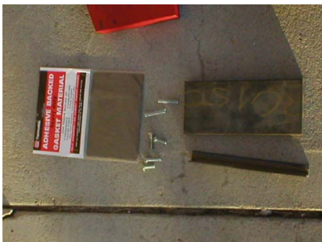
Materials used; 8" x 3/4 x 3 1/2 flat plate steel (you can use heavier or lighter material if you so chose), 8" x 3/4 angle iron, (2) 1/4 x 20 thread eye bolts 1" long, (2) springs, (2) 1/4 x 20 thread nuts, strip of self sticking Gasket material. (Note: I replaced the standard bolts with eyebolts to allow easier tightening and removal of key blanks.)