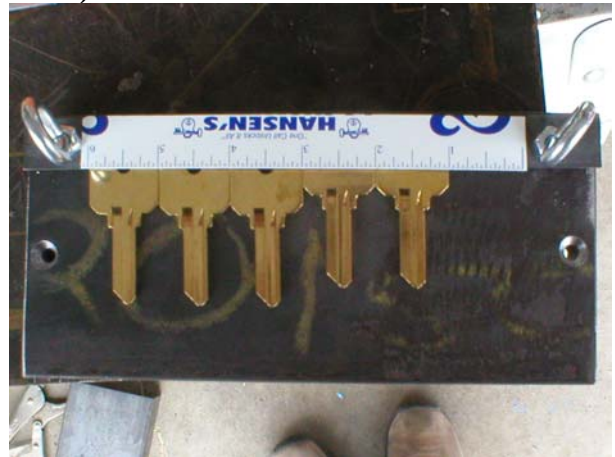
Completed block with holes for mounting and strip of gasket material on the angle iron to help hold the keys, strip of plastic ruler lay on top to allow alignment. Use some felt or something on the bottom of the base plate to keep from marking your counter top even if you plan on bolting it down. (You may want to move it sometime).