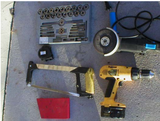
Tools used; hacksaw, angle grinder or flat file, drill bits, tap set, Drill (press preferred), & tape measure.

In this installment we will construct a stamping block that clamps the keys for alignment and to keep them from bouncing off the counter. List of materials used: 8" x 3/4 x 3 1/2 flat plate steel (you can use heavier or lighter material if you so chose), 8" x 3/4 angle iron, (2) 1/4 x 20 thread eye bolts 1" long, (2) springs, (2) 1/4 x 20 thread nuts, strip of self sticking Gasket material. Tools list: hacksaw, angle grinder or flat file, drill bits, tap set, Drill (press preferred), & tape measure. With this tool you can stamp 6 keys at a time on a line, then reset and stamp a second or third line. You can add a ruler to the top to mark out the spacing.