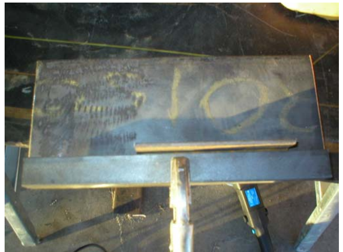
Clamp angle iron on the flat plate to start your holes so they match up. As you drill the holes only drill far enough to mark the base plate. Mark the locations for the pilot holes by drilling until it starts drilling on the base plate.