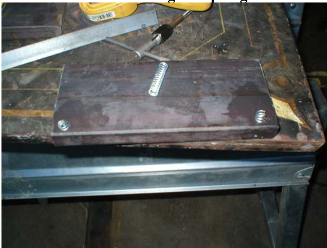
Spring is cut the heavier springs to about 1/3 the length to allow the angle iron to be shoved back up to release the key blanks, making the "clamp" spring loaded.