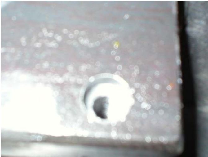
Tap the holes for 1/4 x 20 thread notice the recessed hole for allowing the spring to seat