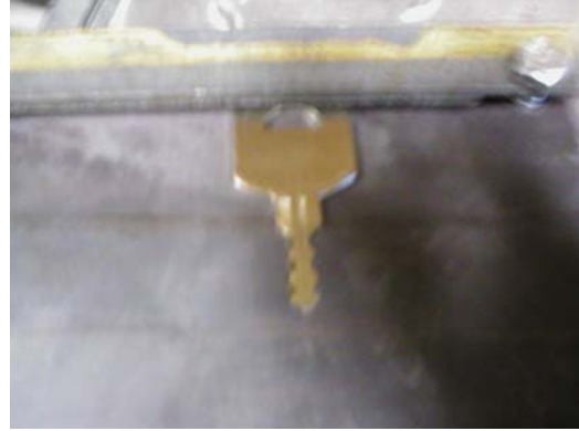
Key extended for stamping different depths (you can stamp more then 1 line of text.)