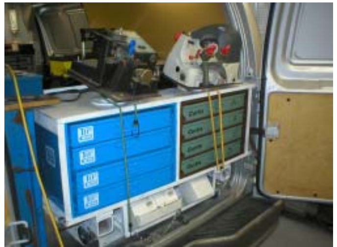
In the swung out position.