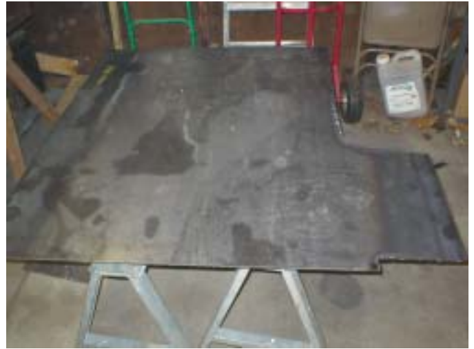
After cutting the sheet with a cutting torch (plasma cutter would have been GREAT but I don't have one. 😊)