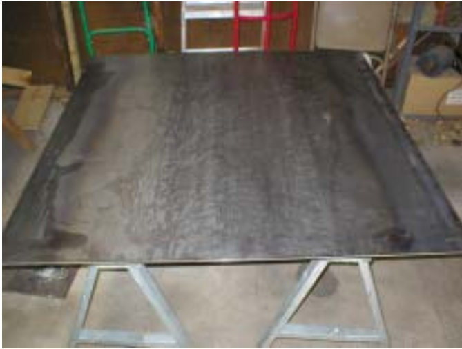
48 x 48 sheet of 3/16 steel this is for the floorboard to allow the rollers to move over the corrugated flooring of the Van