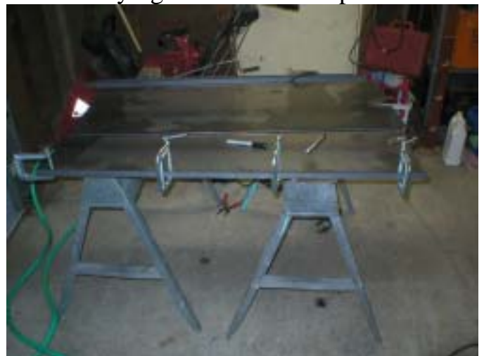
The top and bottom of the cabinet rack (the C clamps are holding the angle iron stop for the cabinets -so they don't slide out of the front)