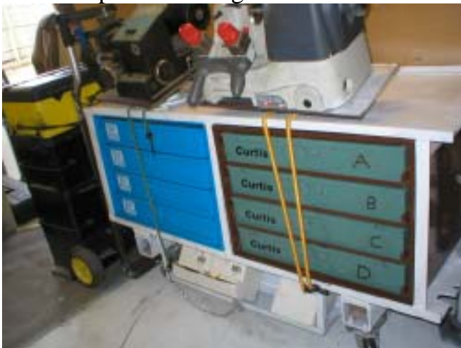
Key storage cabinets installed (they were a tight fit) until the lock-overs are installed he is using bungee cords to keep the drawers in place. Latch bracket not shown (let you figure that one out yourself).