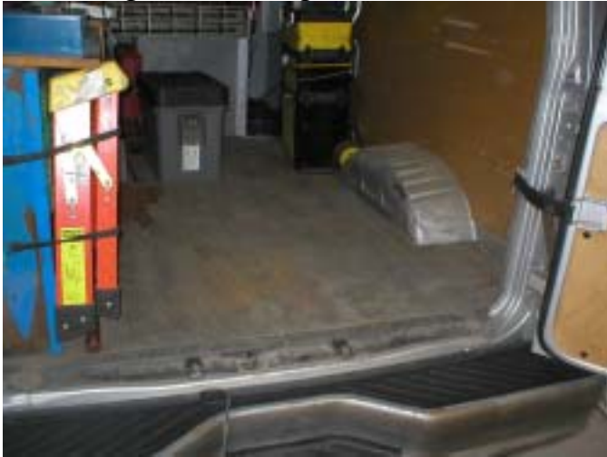
Floor area of the van the steel is to occupy we laid a piece of cardboard down as a pattern to make it as close a fit as we could (note neither of us claim to be metal workers -aka- Welders or Torch men)