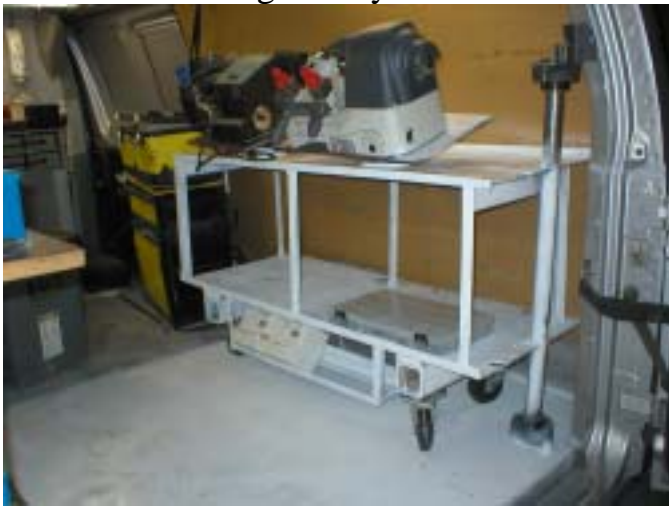
Key Machines mounted HPC 1200 on left, Silica Duplicator on right.