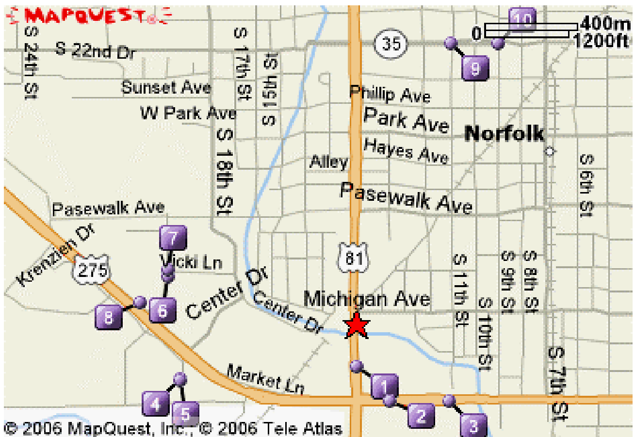
Map to Next Meeting at Norfolk Century Inn 1021 S 13th St Norfolk NE

When information is received I will update the newsletter on the website